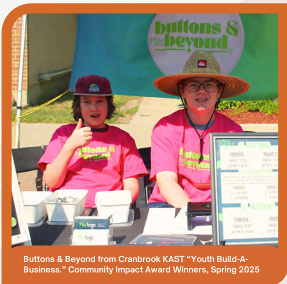
Buttons & Beyond from Cranbrook KAST “Youth Build-A-Business.” Community Impact Award Winners, Spring 2025

Students will put their new skills into action by preparing projects for the showcase. Here's what's expected: