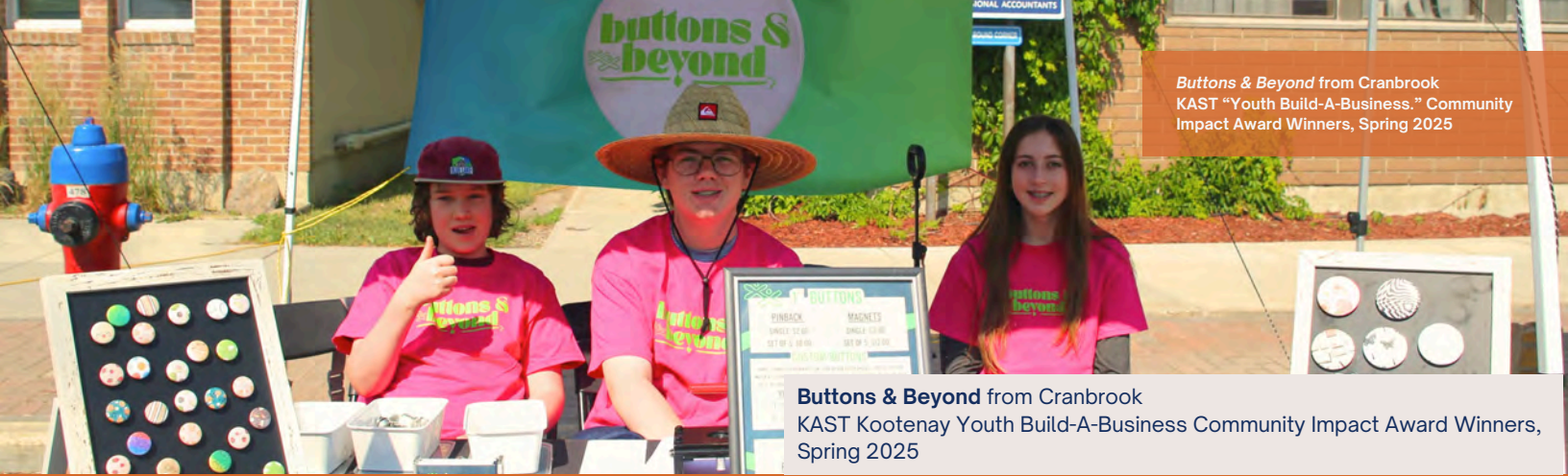
Buttons & Beyond from Cranbrook KAST "Youth Build-A-Business." Community Impact Award Winners, Spring 2025